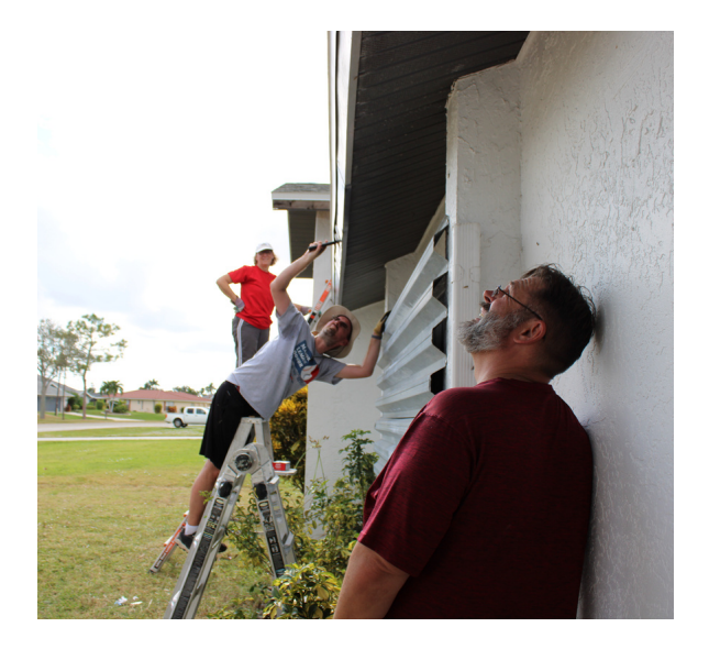
PAGE FIVE | DISASTER RECOVERY

We continue to be extremely grateful for the outpouring of support from partners, churches, and volunteers throughout this recovery. Thank you for efforts in supporting the community when they need it most.